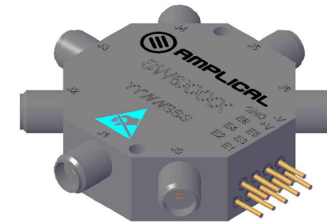
VIEW NOT TO SCALE